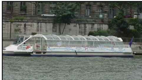
2 x 90 kW – passengers