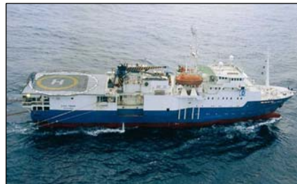
2 x 1100kW – seismic vessel