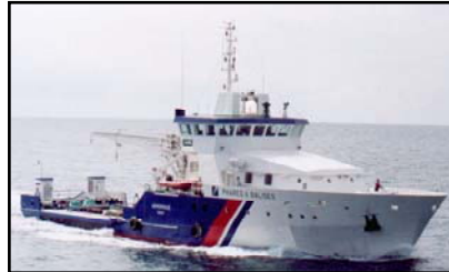
2 x 475kW +1 x 340kW