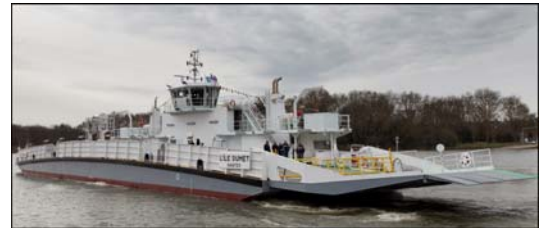
2 x 475kW double ended ferry