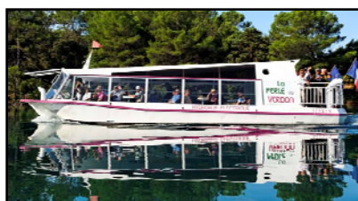
2 x 15 kW batteries