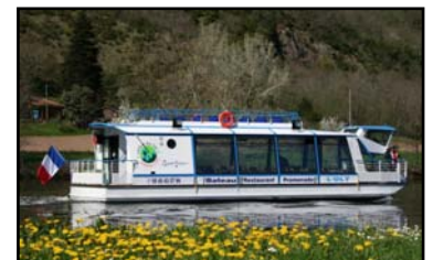
2 x 22 kW batteries