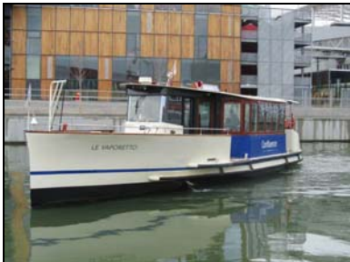
2 x 20kW – hybrid batteries