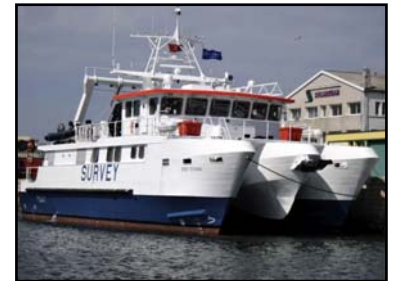
2 x 125kW – survey