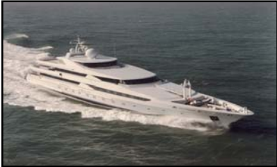
2x110kW + 1x250kW – yacht