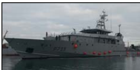
2 x 156 kW hybrid - Navy