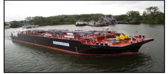
2 x 300kW cement carrier