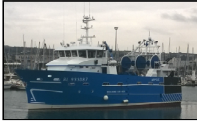
2 gensets 400 kVA high efficiency + 2 x 221 kW propulsion - Trawler