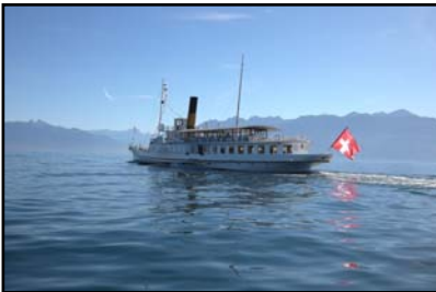
2 x 250kW – paddle wheel